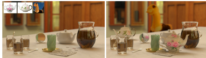
Figure 2: Given an existing 3D scene (left), our method builds approximate object models from image fragments (two teapots and an ostrich) and inserts them in the scene (right). Lighting and shadowing of the inserted objects appear consistent with the rest of the scene. Our method also captures complex reflection (front teapot), refraction (back teapot) and depth-of-field effects (ostrich). None of these rendering effects can be achieved by image-based editing tools, while our hybrid approach avoids the pain of accurate 3D or material modeling. 3D scene modeling credit to: Jason Clarke.

The coarse shape produces a smoothing shading that captures directional and coarse-scale illumination effects that are critical for perceptual consistency. The shape is reconstruction based on contour constraints (shape from contour), which is stable and robust to generic views. The two detail layers account for visual complexity. The parametric residual S_p is residual of fragment shading estimate (recovered from image by color Retinex) and a parametric shading image, which is the shading of the coarse shape by a parametric illumination fit to the shading estimate. The geometric detail